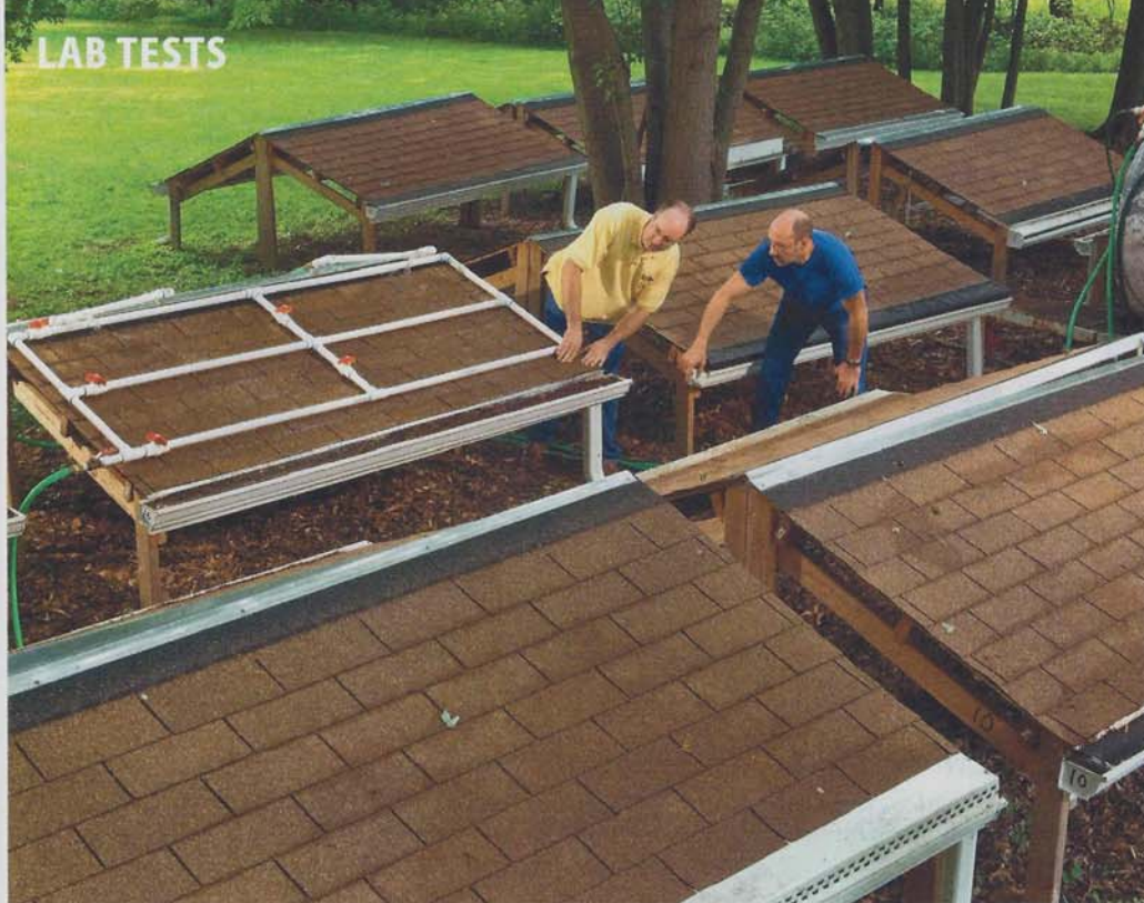
RAINMAKERS Testers simulate rainfall on one of the roof systems built for this report.